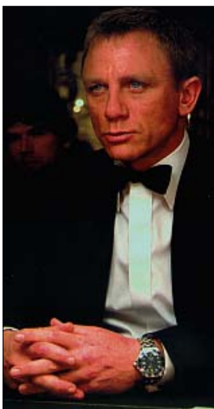
In "Casino Royale," Daniel Craig plays James Bond and wears an Omega Seamaster Professional 300M watch.