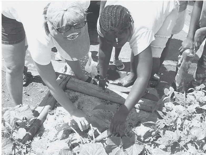
HIP Kids Gardening Project

Area IV of the Association of Junior Leagues, Inc.